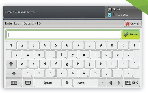
Xerox Network Accounting Authentication Window