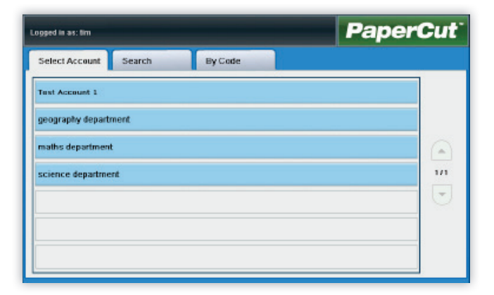
Charging to a share account while copying