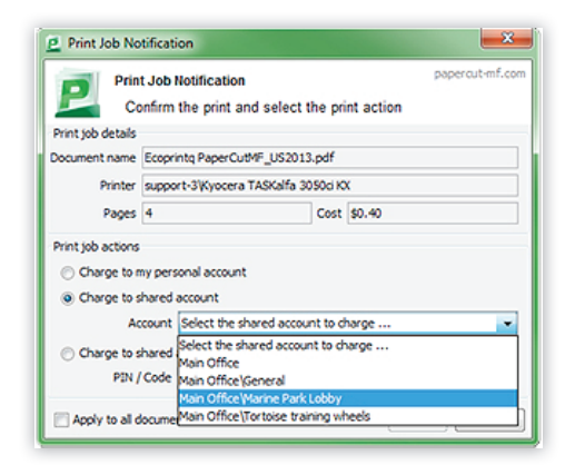
Charging to a share account while printing from a workstation

The embedded copier interface is consistent with the workstation print interface, meaning users only have to learn one system and one set of terminology. Jobs may be allocated to shared accounts that represent departments, projects or clients.