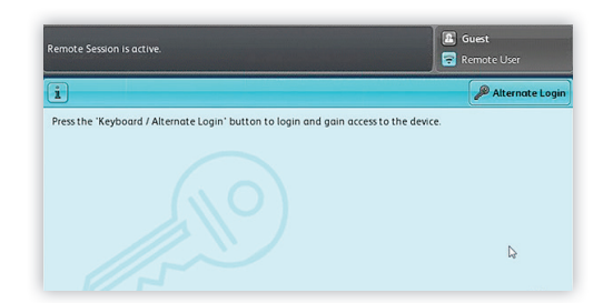
Optional Authentication Window when using HID Card.