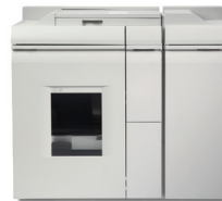
Basic Finisher Module Plus