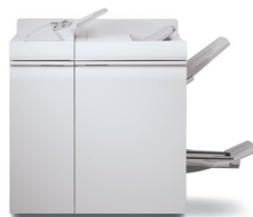
Multifunction Finisher Pro Plus