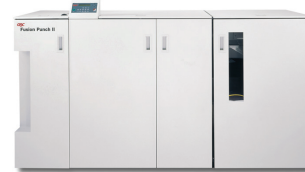
GBC FusionPunch II with Offset Stacker