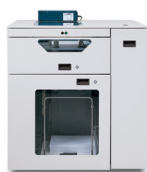
C.P. Bourg BSFx Dual Mode Sheet Feeder