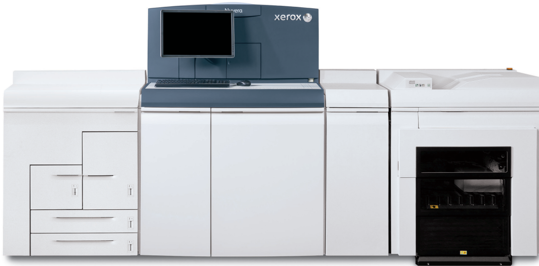
Xerox Nuvera® 157 EA Production System with Xerox® Production Stacker