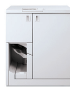
Xerox® Tape Binder