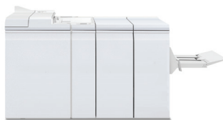
Plockmatic Pro 30/50 Booklet Maker (Available on 100/120/144/157 only)