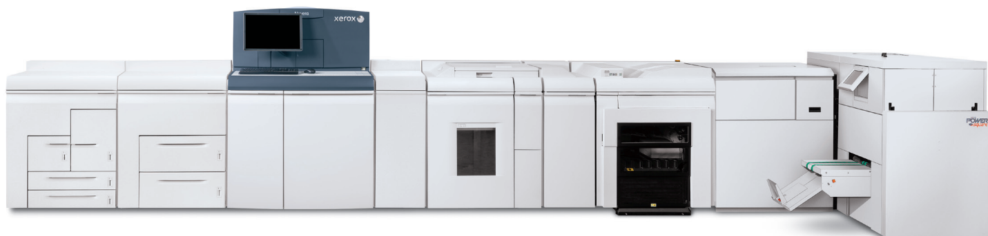
Xerox Nuvera® 157 EA Production System with Xerox® Production Stacker and Watkiss PowerSquare 200