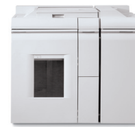
Basic Finisher Module – Direct Connect