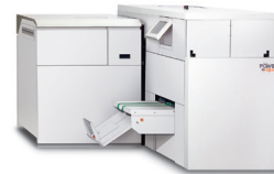
Watkiss PowerSquare 200