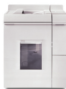
Basic Finisher Module