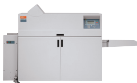
C.P. Bourg BDFNx Booklet Maker with Square Edge