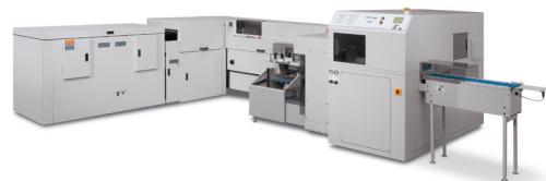
Xerox® Book Factory